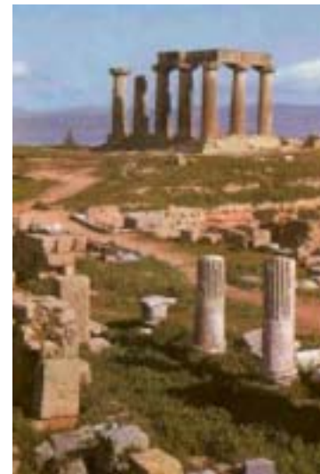
The ruins of the Temple of Apollo in Corinth, where the Temple of Venus was once housed.

Paul's argument against fornication with the temple harlots was: that to do so polluted the body of Christ of which they were members, and so Christ was also affected. Though they were joined to Christ for ever, in the Spirit, they were also joining their body, for a time, to the Harlot and this was fornication, and a deadly sin. For in verse 9 he had warned them that fornicators would be excluded from the Kingdom of God. Paul tells them to " flee fornication ", which implies get away from it at all costs.